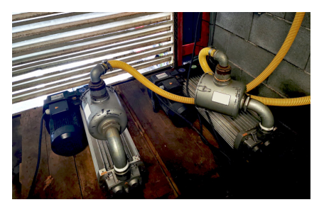
NOVADRY ND65 remotely installed and running on tumbling process.

Last but not least, the 100% oil-free feature avoids the use of hydrocarbons, which are more and more difficult to recycle, for a positive impact on the environment!